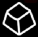
Keycaps with high PBT content