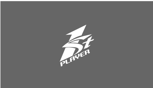
PC GAMING CASE X2-M