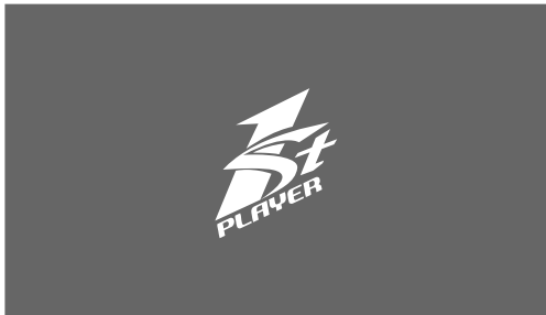
PC GAMING CASE X1