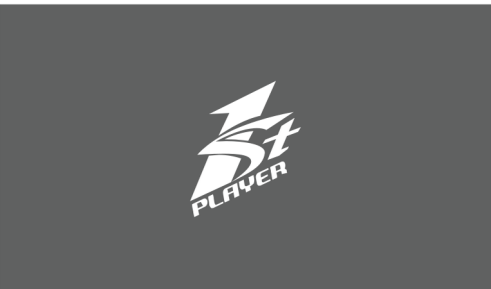
CPU LIQUID COOLER X-360