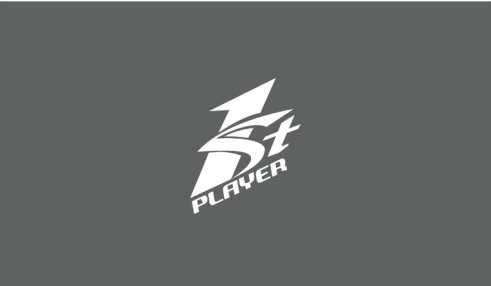
CPU LIQUID COOLER TS2 360