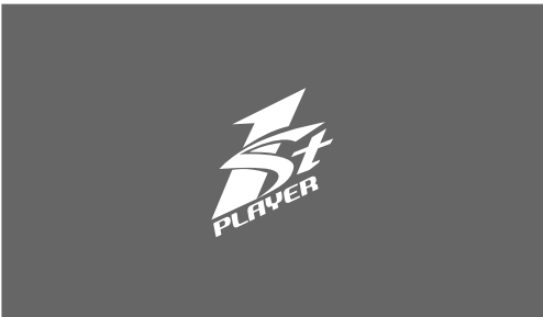
PC GAMING CASE Mi7-A