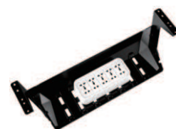
Equip with cable management compartment