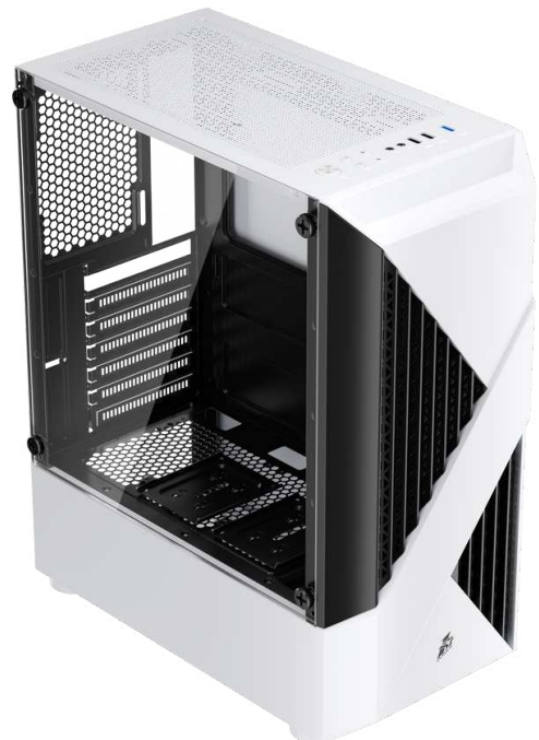
GAMING PC CASE F3-A